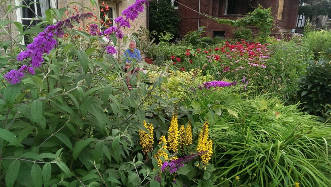
One of many pollinator-friendly yards in the City of Madison

As numbers of honeybees and native pollinators continue to decline, it is essential to take steps to not only protect pollinators, but to create an environment in which they will thrive. The City of Madison Pollinator Protection Task Force is tasked with the goals of: