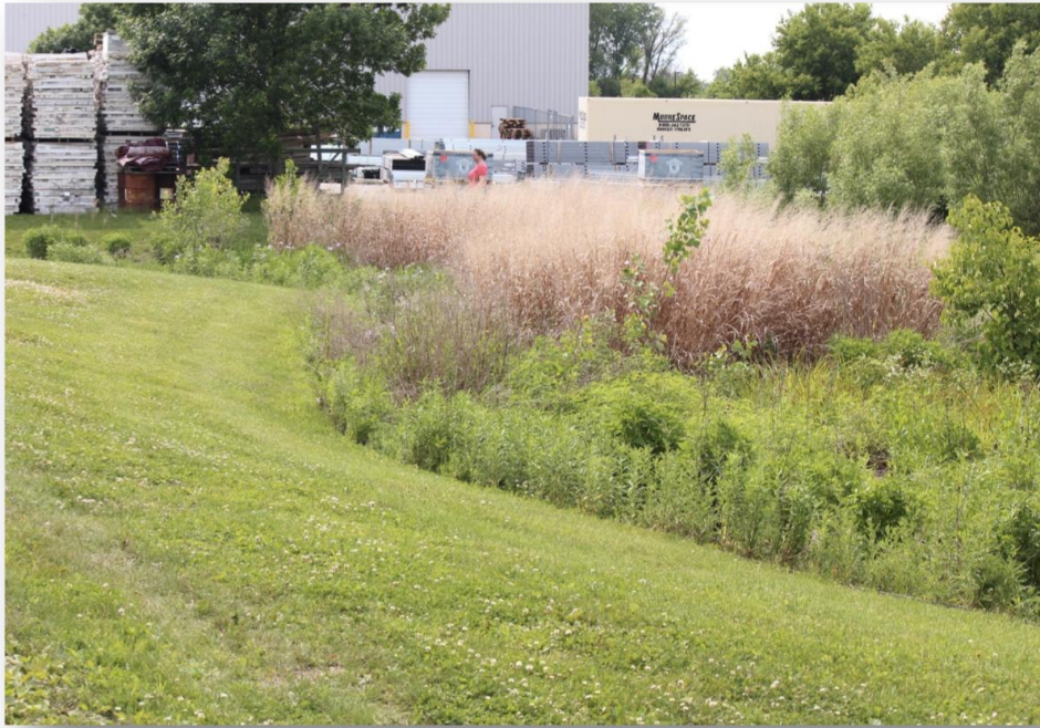
Greenway and rain garden at the police training facility on Femrite Drive