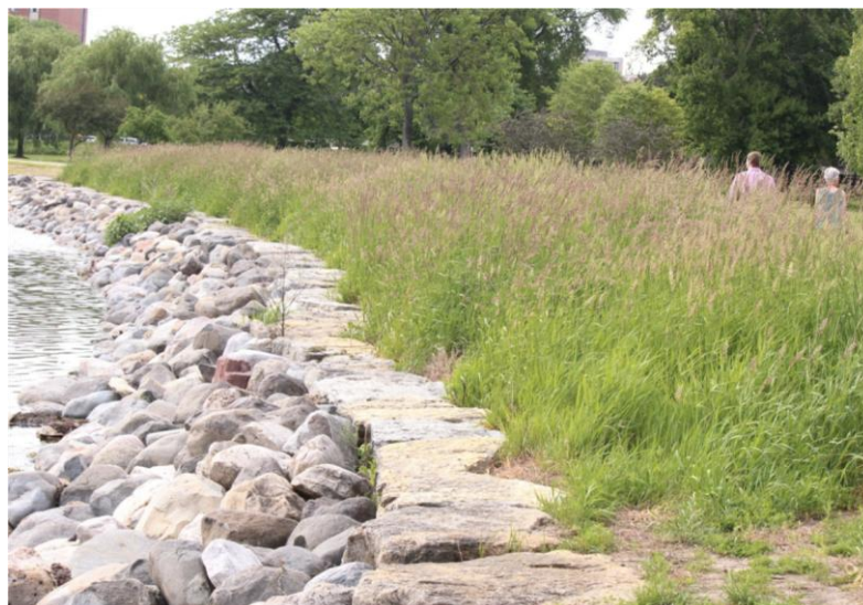
Brittingham Park, along the Monona Bay shoreline

Madison Parks operates under the philosophy that protecting parks land equals protecting assets for years to come. The City of Madison has 14 conservation parks totaling over 1,600 acres. Conservation parks are managed to preserve the native plant communities, wildlife, and the natural landscape. These parks are developed for controlled public access and managed to preserve and restore native plant and animal populations. Within each of these specialty parks are pollinator-friendly habitats that promote and welcome pollinators.