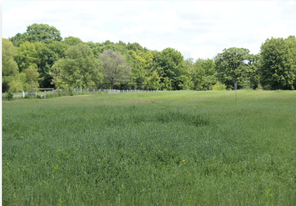
Warner Park dog park area

Land management within Parks varies based on its designated purpose. Conservation Parks are primarily used for passive recreation, with the notable exception of cross-country skiing and snowshoeing in the winter. Within General Parks, most of the acreage is not used for active recreation. Generally, land that is mowed as a finish cut is used actively.