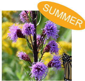
Meadow blazing star