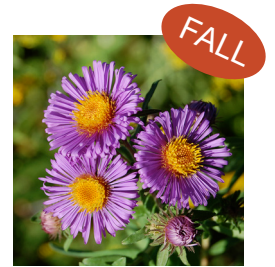
New England aster

If you want to plant plugs or potted plants, you can put them in the ground in spring and summer. If you want to use seed, scatter your seed in fall or winter just before it snows.